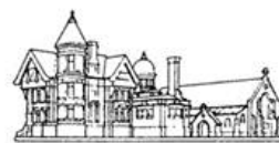
THE NEWMAN FOUNDATION OF TORONTO

4 pm - 4:45 pm Newman Foundation Board of Directors Meeting