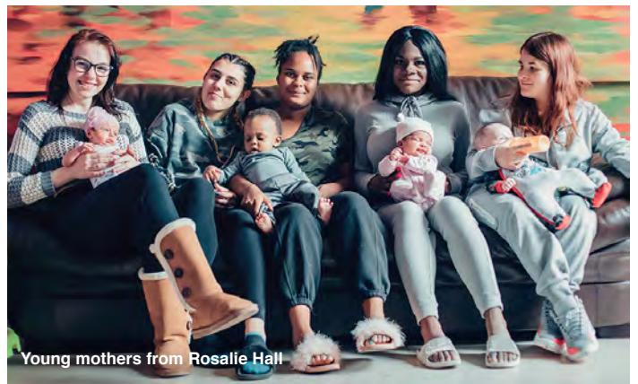
Young mothers from Rosalie Hall

Who You Help: Your gift helps people of all ages, ethnicities and backgrounds in our communities. Learn more about the different groups of programs funded through ShareLife by visiting: www.sharelife.org